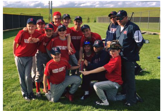
2 nd Place Champs

Thanks to all the parents who helped out as well. If you are interested in coaching next year, please let me know. We are losing a lot of 8th grade parents!!