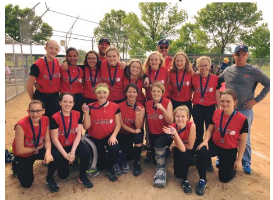
2 nd Place Champs