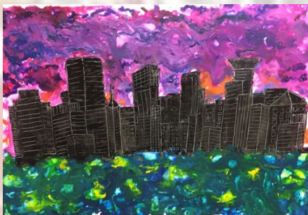
The Gala Committee

Take a look at our Facebook page: https://www.facebook.com/SHCSRobbinsdale/ Click on the Events tab (left side) and check out the Gala page. We look forward to seeing you on the 21 st !