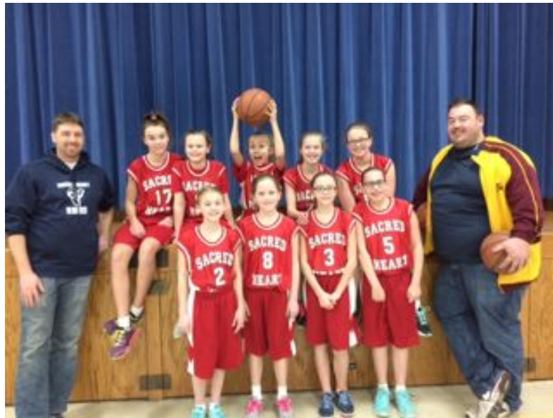
2016-2017 Girl's B-Squad Basketball Team and Coaches Great teamwork this season!

6 th and 7 th graders partner with Totino-Grace High School Engineering Dept. Our students had the opportunity to use Arduino, which is an open-source electronics platform. Our students learned how to use this software to build electronics projects. Arduino consists of both a physical, programmable circuit board and a piece of software that runs on the computer, used to write and upload the computer code to the physical board. Thank you to Totino-Grace teachers and students for helping our students learn all about programming.