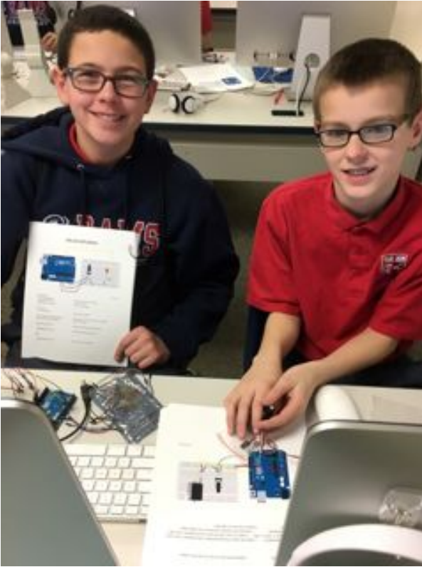
Totino-Grace Arduino workshop: grades 6 and 7